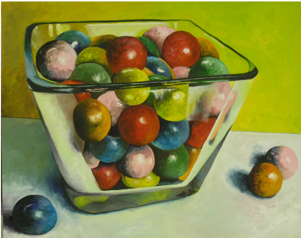
Student - Multiplicity Project

Draw your composition on canvas and spray with fixative when done. Each student will stain their piece before painting. The stain should be a color that relates or compliments the image you are painting. Separate canvas not on supply list – 18" x 24" suggested.