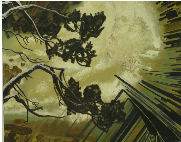
Student - Multiplicity Project