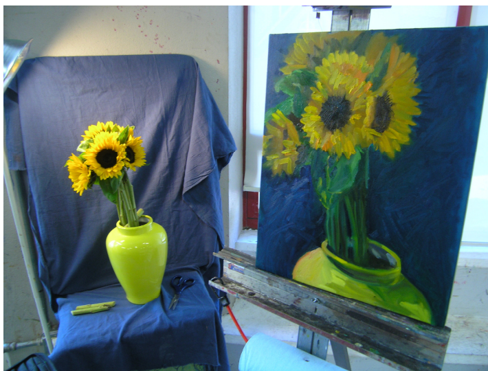
Student - Multiplicity Project